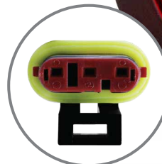
Uses 3 Pin (87368 plug / 87369 adapter) Sold Separately