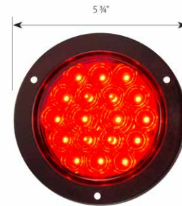
Front view 75895