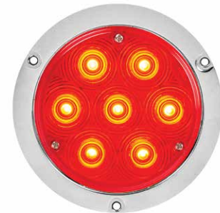
Housing not included

Grand General is now offering a new style of load light in the popular fleet series featuring 7 high power SMD LED's. The light easily fits into the stock load light housing behind the cab/sleeper and plugs into the existing #1157 socket. Best part of all, available in 5 different lens colors.